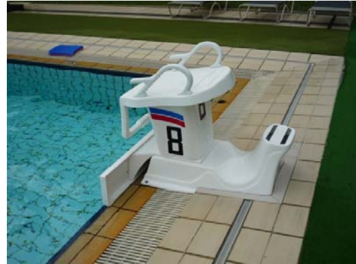
ANTI BLOCK 700 = 400 + ELEVATOR