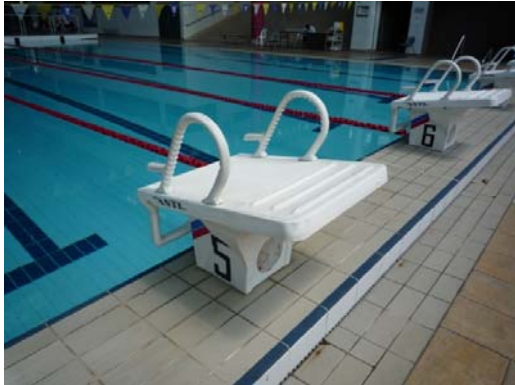
ANTI BLOCK 400