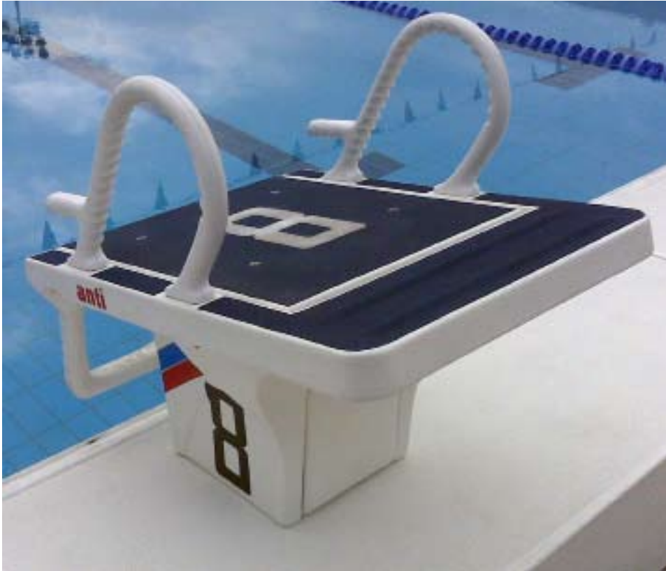
Anti Wave SuperBlock

The Anti Wave SuperBlock is the premium starting block for major competitions and combines performance with unbeatable value.