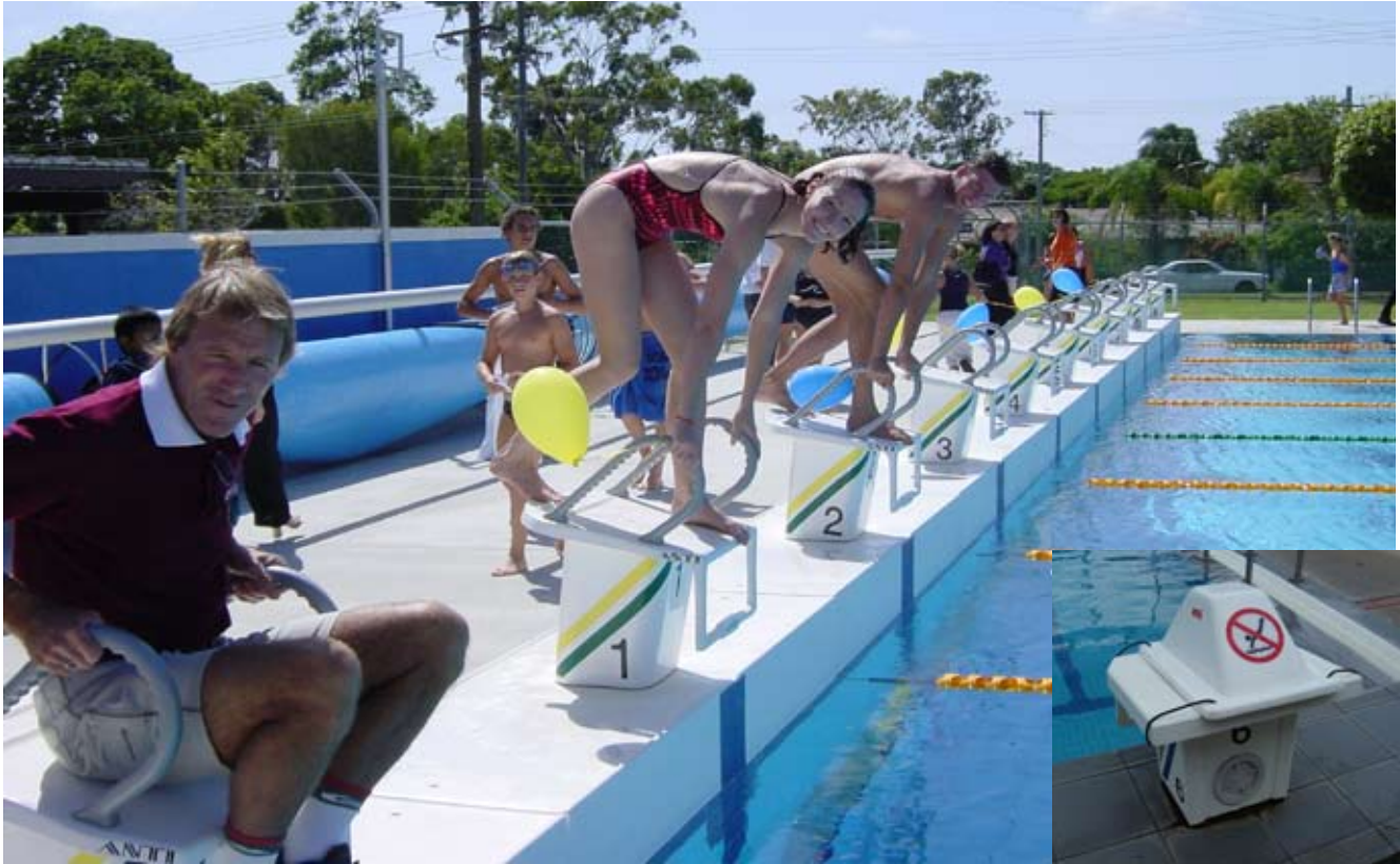
Anti Wave Starting Block • Stop Diving Cone

The Anti Starting Block is designed for the requirements of most normal competition and training pool layouts at the best price.