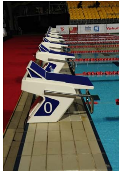
OMEGA OSB11 START BLOCK